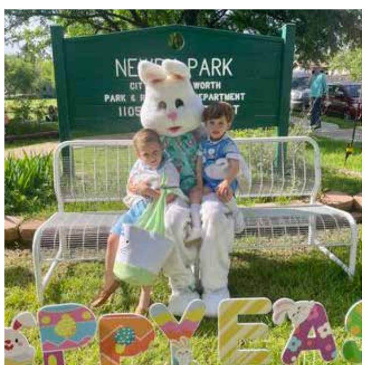
Cont'd on page 6.