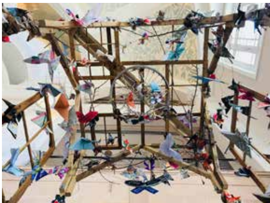
Student recycled art displayed at Bass Hall.

The Welman Project is located at 4201 Trail Lake Drive, Fort Worth, TX 76109, at the back of the First Congregational Church parking lot. It is open to accept donations Monday-Thursday, 3:30-6:30 pm, and Tuesday, Thursday, Saturday, 9-12 pm. For large item donations, or to volunteer, you can find more information on its website, thewelmanproject.org .