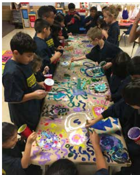
Misprinted shirts used as smocks.