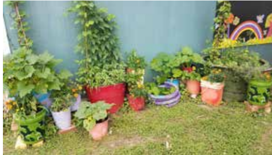
Garden of repurposed stuff.

STEAM stands for science, technology, engineering, art and math. You may have heard about a focus on STEM in schools, to prepare students for the kind of jobs that are available in today's society. Most teachers agree that art is a vital component of education, so it's often included in the acronym. Art education activates a student's strengths, increasing the probability of STEM success by engaging all types of learners. All of these subjects, and the jobs they lead to, require innovative thinking and problem-