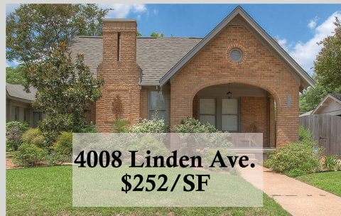
4008 Linden Ave. $252/SF