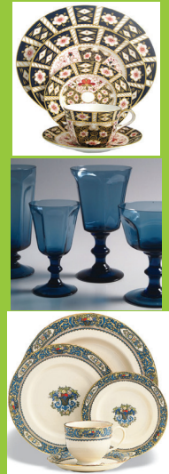
Best Dinnerware Selection in DFW