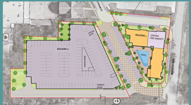
Ground-level site plan for Mistletoe Station development