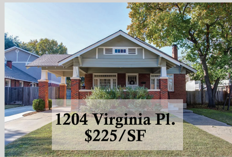
1204 Virginia Pl. $225/SF