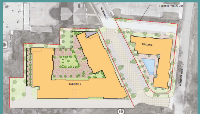
Site plan for upper floors of Mistletoe Station development