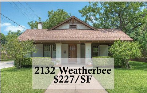
2132 Weatherbee $227/SF