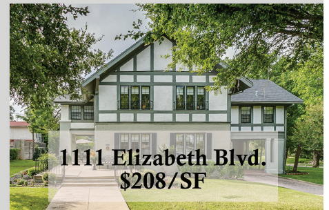
1111 Elizabeth Blvd. $208/SF