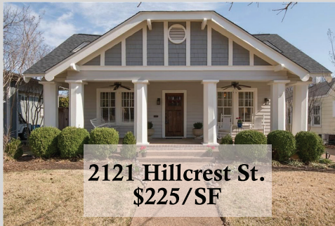
2121 Hillcrest St. $225/SF