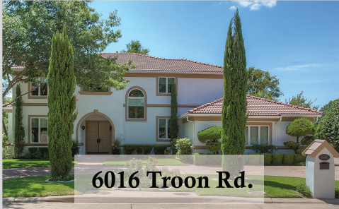
6016 Troon Rd.