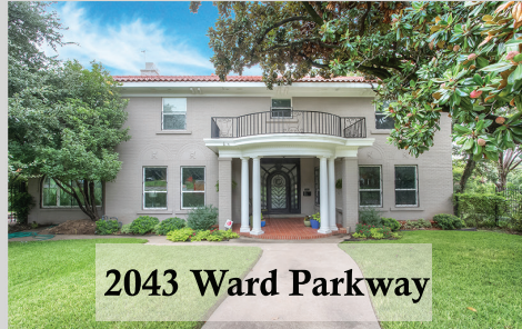
2043 Ward Parkway