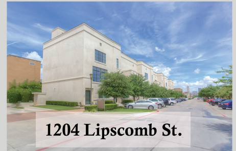
1204 Lipscomb St.