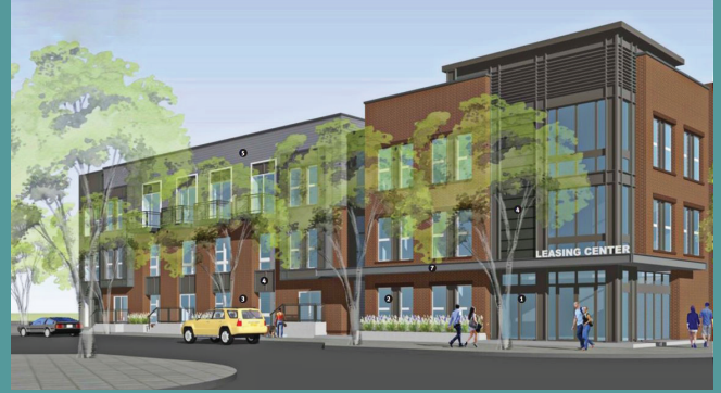
Developer's preliminary rendering of residential building at Mistletoe Station development