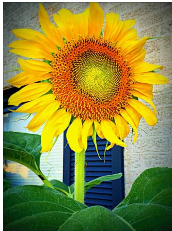
Neighborhood Sunflower

Tutoring Pre-K-2nd Grade. Is your child falling behind? Need some one-on-one attention? Don't want your child to lose what they've learned over the summer? I can help! Call Joy Ridler at 817.637.5541.