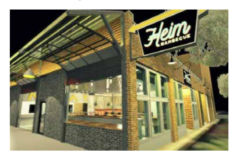
An architectural rendition of Heim Barbecue, soon to open at 1109 W. Magnolia Ave.

called The Space, which they opened in November.