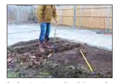
The beginnings of Kyle's garden.

As spring approaches, it is that time of year to compile to-do lists for yard work and gardening—rain barrels, soil testing, shovels, worm farms, compositing, and seeds are all on my list. Even more important than the to dos, however, are the benefits you reap. Gardening decreases your carbon footprint; increases the health of your