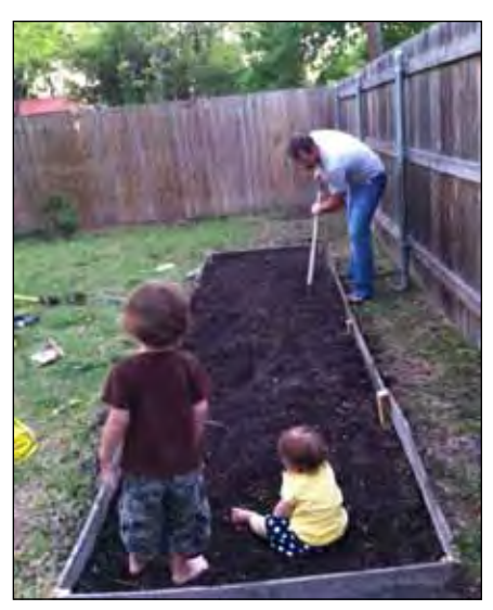
Raised beds are an easy way to start your garden. Top photo by Stefanie Ball Piwetz, bottom photo from messymom.com

Easter Egg Hunt 10 a.m. Saturday, March 30 @ Newby Parl