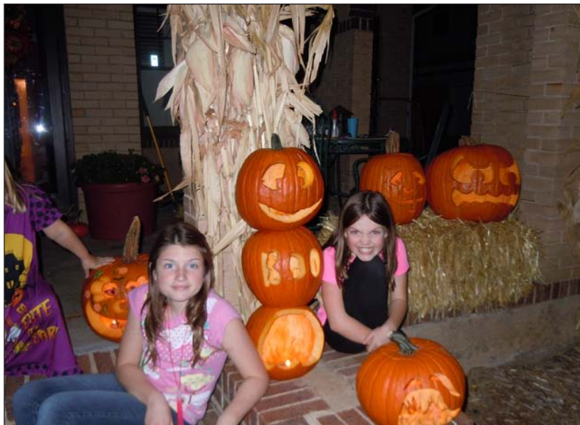
GRAND PRIZE WINNER DESIGNER PUMPKIN PATCH | 2218 HARRISON