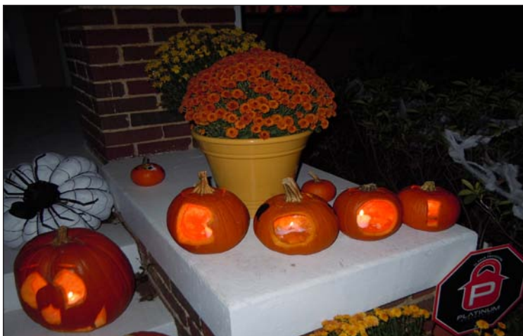
BOO-LICIOUS | 2241 MAGNOLIA