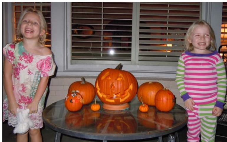
MIGHTY GRIN | 1221 CLARA

"3 Stooges" @ 2207 Rosedale "Mummified" @ 2341 Mistletoe Blvd. "Jeepers Peepers" @ 2201 Rosedale. "Pumpkin Cognito" @ 2232 Irwin "Boo bolicious" @ 2241 Magnolia "Ghostly Gourds" @ 2223 Harrison "Designer Pumpkin Patch" @ 2218 Harrison "Double Double Toil and Trouble" @ 2126 Mistletoe Ave. "Mummikin" @ 2228 Mistletoe Ave. "Ghost and Goblins" @ 2204 Mistletoe Ave. "Toofus" @ 2201 Edwin "Here Come the Judge" @ 2210 Weatherbee "Joe & Oscar" @ 2132 Edwin