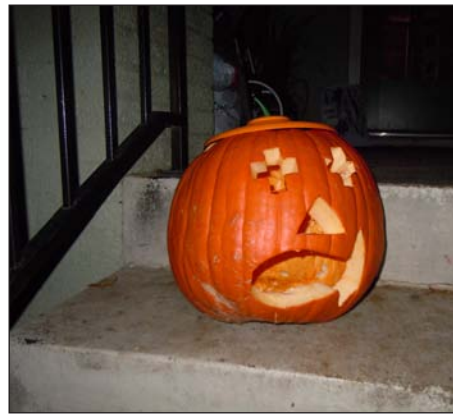
SACRED PUMPKIN | 1101 CLARA

"Sacred Pumpkin" @1101 Clara "Toothsome Twins" @1211 Clara "Mighty Grin" @1221 Clara "Witch Cat & Lego" @1119 Mistletoe Drive "Let go of my feet" @ 1301 Mistletoe Drive "Scary Steve & Funny Fred" @ 2340 West Magnolia "Charlotte and Beau" @ 2336 West Magnolia