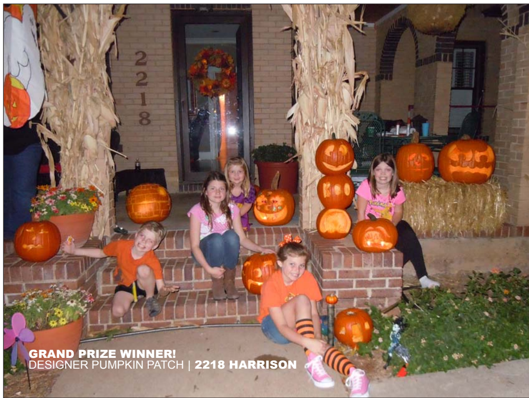
GRAND PRIZE WINNER! DESIGNER PUMPKIN PATCH | 2218 HARRISON