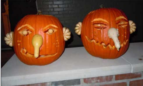
DOUBLE DOUBLE TOIL AND TROUBLE | 2126 MISTLETOE AVE.