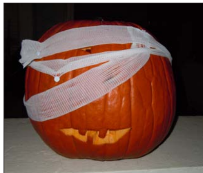
MUMMIFIED | 2228 MISTLETOE AVE.

As usual non-carved but delightfully decorated and lit porches abounded, and although not part of the contest, certainly greatly contribute to the Harvest Season in Mistletoe Heights. What a GREAT neighborhood ...Yea! NEIGHBORS!!