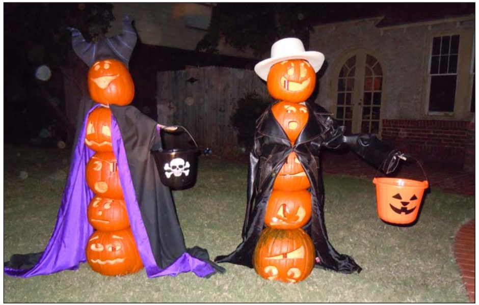
PUMPKIN COGNITO | 2232 IRWIN

Honorable Mentions are due to many carvers. Last years winner proudly greeted the judges @ 2232 Irwin with a fine tower we named "Pumpkin Cognito", and then those "Hungarian brothers" went to a huge effort @ 2126 Mistletoe Ave. with "Double Double Toil and Trouble." We had some camera trouble so we didn't get photos of every one of the great pumpkins carved.