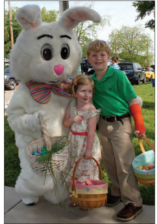
See more photos on Page 8-9