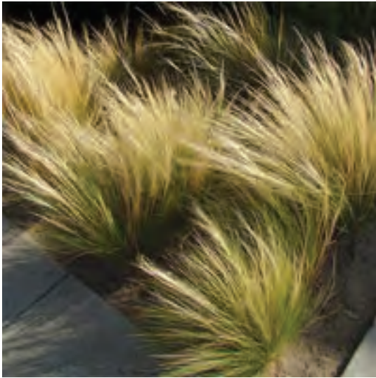
Mexican Feather Grass, a Texas native.

Prairie Day celebrates the beauty of the North Texas native landscape through a series of family-oriented, hands-on events that showcase the native grasses, wildflowers, and vegetation blanketing the BRIT site. Maintaining and researching native landscapes is part of BRIT's ongoing