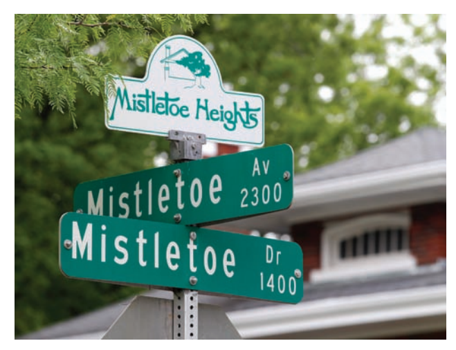
Check out our updated website: www.mistletoeheights.com