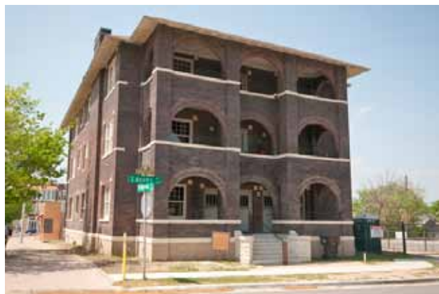
A couple of the tour homes on South Adams

Tickets are $12.00 if ordered in advance, and $18.00 on the day of the tour. Tickets stop being sold online on Saturday May 7 at 9 a.m.