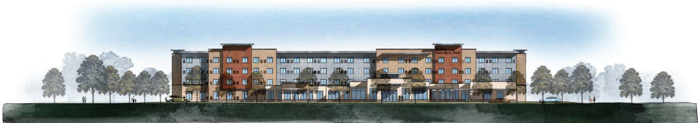
ILLUSTRATION © ROBERT ULRICH, ULRICH VISUAL