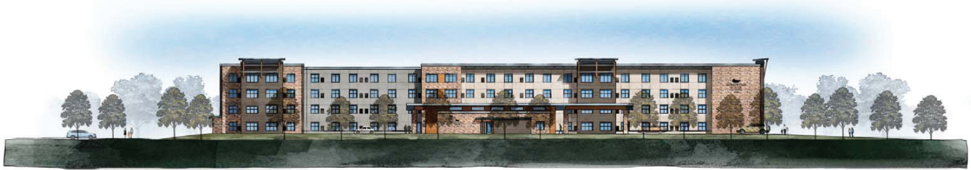
ILLUSTRATION © ROBERT ULRICH, ULRICH VISUAL