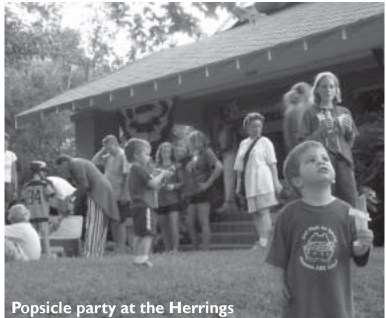
Popsicle party at the Herrings