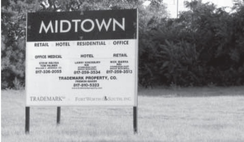
A sign announcing the Midtown Project's location has been up for months on the corner of Forest Park Boulevard and Rosedale. The project has stalled for environmental reasons.